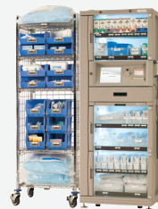
Hybrid solutions Secure and open access technologies

RFID auxiliary (not pictured) Secure stent management 31" W x 28" D x 79.5" H