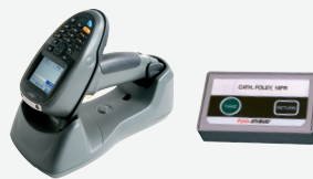
Open access solutions Pyxis ProcedureStock™ system Barcode inventory management Pyxis JItrBUD system Wireless inventory management