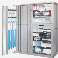
Pyxis CathRack Secure cath lab inventory management 52" W x 28" D x 79.5" H