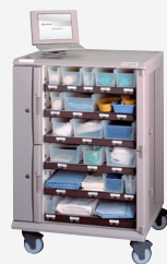
Pyxis ProcedureRoller™ system Secure mobile inventory management 35.5" W x 28" D x 56" H