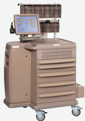
Pyxis Anesthesia system Secure medication and inventory management 47.5" W x 28" D x 61" H

Pyxis Perioperative Solutions help clinicians save time while providing hospitals a continuous return on investment. Whether for the operating room, cath lab or specialty areas, Pyxis Perioperative Solutions can help facilities increase product standardization, capture patient charges by procedure and improve case and revenue cycle management.