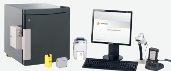
Pyxis ProcedureStation system with Tissue and Implant module Tissue and implant management

RFID auxiliary (not pictured) Secure stent management 31" W x 28" D x 79.5" H