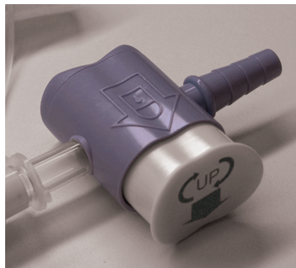
Closed suction control valve