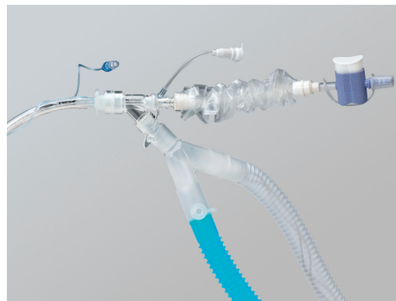
Adult AirLife™ Closed Suction System

*All system components of the AirLife™ closed suction system may not be commercially available as of the publication of this brochure.