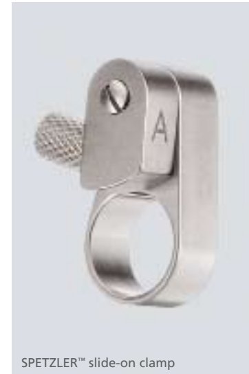
SPETZLER™ slide-on clamp

The snap-on and slide-on designs help give the surgeon maximum flexibility in positioning and re-positioning the scalp flap.