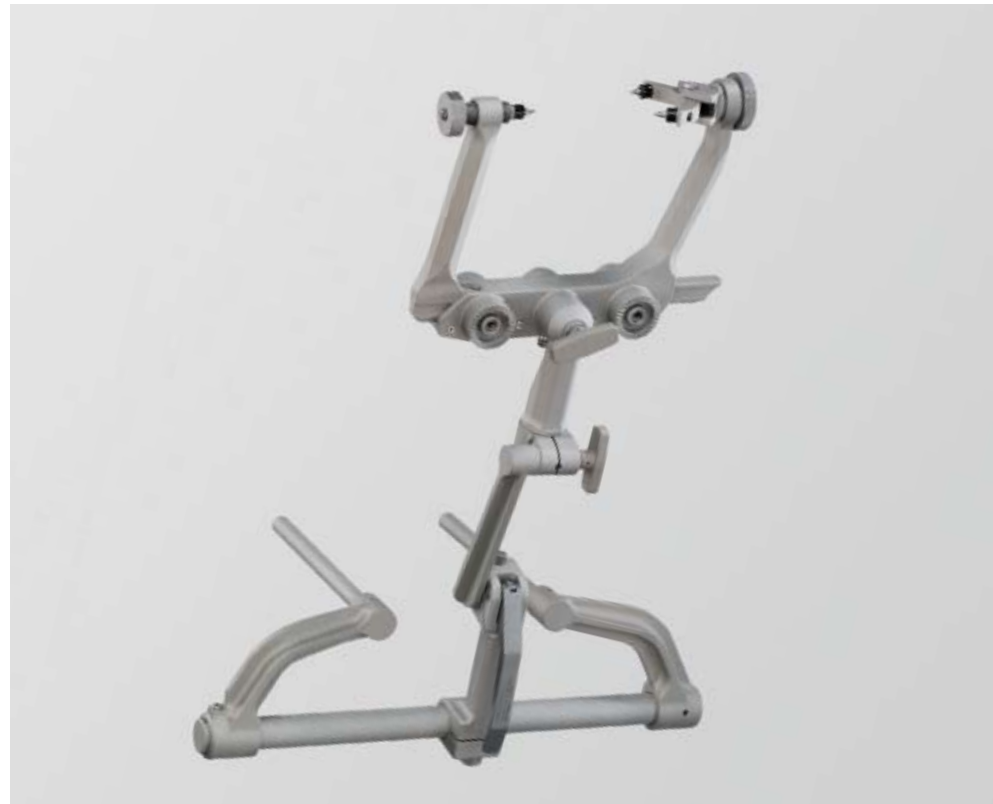
The SPETZLER™ headrest system (cat. no. Z-0200) offers optimal flexibility in patient head stabilization during neurosurgical procedures.