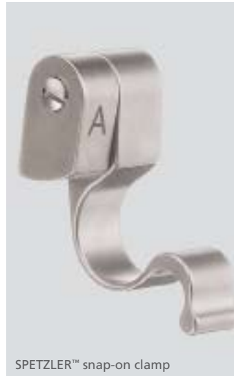
SPETZLER™ snap-on clamp

The SPETZLER™ clamps enable quick assembly for scalp retraction and easy readjustment during supratentorial and infratentorial skull operations.